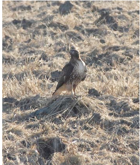
Our most common weekend raptor, the Red Tail Hawk. This one just pounced on breakfast!