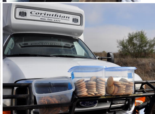
Images taken during our day – Birding by tour bus with the "Birdaloo" in tow – Karl Fowler / Cackling Geese overhead – Brooke Miller / Tundra Swan drops down out of the tulle fog – Ellen Bateman / A bus load of birders wave for the camera – L. Myers / Three Greater & one Lesser Sandhill Cranes – Brooke Miller / A bike rack makes the perfect cookie holder – L. Myers