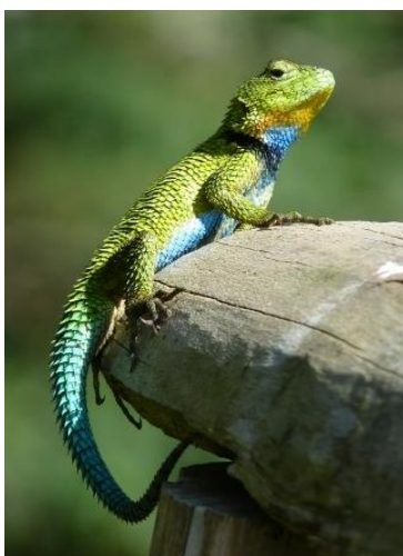
Green Spiny Lizard

Day 14, January 31: Finally we'll return to San Jose and the Hotel Bouganvilla for our final night's stay & farewell dinner. You'll have time to prepare for your departing flight the next day.