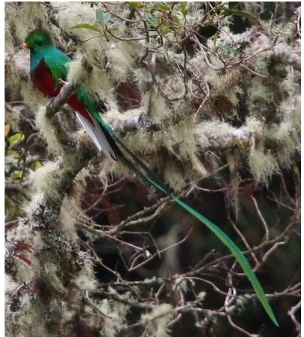
Resplendent Quetzal – Brooke Miller

Day 12 & 13, Jan. 29 & 30: Spend the next two days exploring the gardens, riparian highland habitats, and old growth tropical oak cloud forests surrounding the Savegre Mountain Lodge . Walking through the gardens and along the Savegre River, we can hope to see Flame-colored Tanager , Collared Trogon , Torrent Tyrannulet , Volcano hummingbird , and Gray-tailed Mountain Gem , among many others. Some of the other species we will be looking for include Black-faced Solitaire , Spotted Wood-Quail , Buffy Tuftedcheek , Golden-browed Chlorophonia ( Blue-hooded Chlorophonia ), Ochraceous Wren , Ornate Hawk-Eagle , and the Resplendent Quetzal .