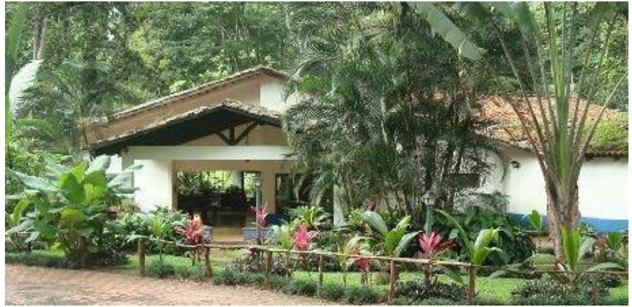
Hotel Villa Lapa

southern coastal region joins the dry climate of the northern Pacific area, becoming a rich meeting ground for species from both regions. This is truly one of the highlights of the tour, where we'll look for Orange Collared Manakin dancing in their lek. This is a great location to spot antbirds, Rufous-tailed Jacamar , up to five different species of Trogons and even Royal Flycatchers .