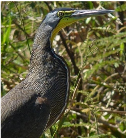
Bare-Throated Tiger Heron

Day 2, January 19: Travel west to Hotel Villa Lapa , situated at the edge of the Carara Biological Reserve on the banks of the Tarcoles River near the Pacific coast. We will stop en route to look for Blue-winged Teal , Least Grebe , Northern Jacana , Aningas , and Cormorants . After lunch at the hotel, we will explore the bird-rich trails through the forest, and hope to see Scarlet Macaws and Tiger Herons , Long-tailed Manakin , and Baird's Trogon , among many others. We will also visit the nearby Playa Azul where some of the species we will look for are Gray-necked Wood-Rail , Yellow-crowned Night-Heron , Red-crowned Woodpecker , Melodious Blackbird , Bare-throated Tiger Heron , Pacific Sreech-Owl , Spectacled Owl , plus shorebirds.