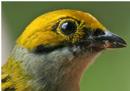
Silver-throated Tanager