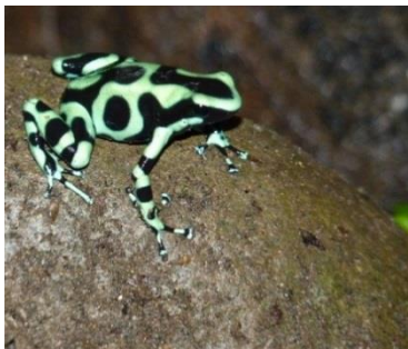
Poison Dart Frog