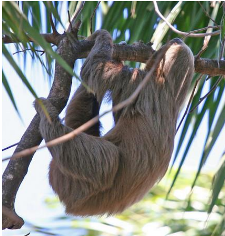
Hoffman's Two Toed Sloth – Brooke Miller

420 bird species, more than 500 species of butterflies, 55 species of snakes, and 120 species of mammals. A vast variety of different species of trees can be seen in the arboretum. This is the most likely place to make your tinamou dream come true. There are three species of Tinamou that inhabit La Selva. We will be looking for Rufous Motmot , Trogon s, Caciques , Purple-throated Fruit Crow , and Snowy Cotinga , among many others. Animals here are not shy, providing ample photo opportunities. Peccaries, agoutis, coatis, sloths, and monkeys frequent the area. All of which makes for an unforgettable experience.