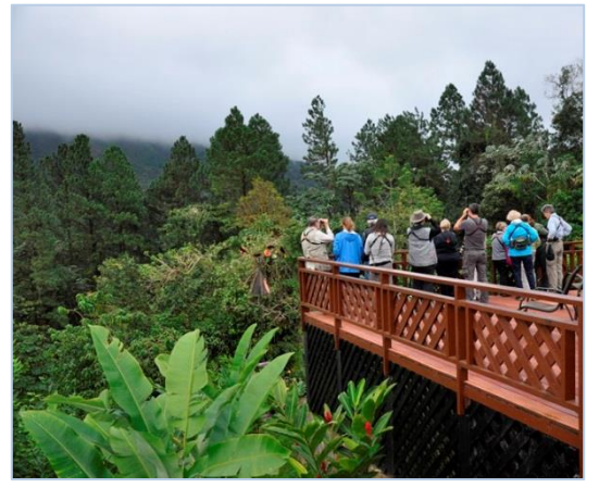
Birding off the deck at Arenal

Day 5 & 6 - March 25 & 26: Travel west to Arenal Volcano National Park where we will stay at the Arenal Observatory Lodge. This is a favorite destination & is the closest lodge one can stay near the 5,358 foot Arenal Volcano. The jungles of the area provide us with a new habitat for the tour. With over 870 acres of wildlife found here, birding starts right outside our rooms and along the extensive trails located around the lodge providing tremendous opportunities to view the Crimson-collared Tanagers, White Hawk, Brown-hooded Parrot, Montezuma Oropendola, Golden-olive Woodpecker, three species of Toucans and night glowing fireflies.