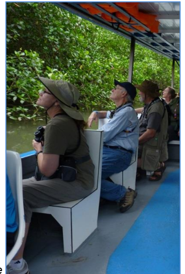
We'll bird the mangroves along the Tarcoles River by boat

Day 9, 10 - March 29, 30: We'll then move South/East up in elevation & spend the next two days exploring the gardens, riparian highland habitats, and old growth tropical oak cloud forests in and around the Savegre Mountain Lodge. This area provides a different habitat than anywhere else we will have visited during our time in Costa Rica. Walking throughout this area & along the Savegre River we'll look for Flame-colored Tanager, Collared Trogon, Torrent Tyrannulet, Gray-tailed Mountain Gem, Buffy Tuftedcheek, Black-faced Solitaire, Spotted Wood-Quail, Ornate Hawk-Eagle, Ochraceous Wren, and the Resplendent Quetzal.