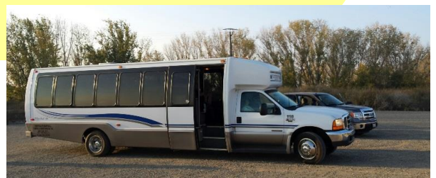
Images of our day: Sandhill Cranes flying over pasture, juvenile Red-tail Hawk, Greater White Fronted Geese and White-crown with Golden-crown Sparrows all taken by Tony Woo. White-faced Ibis – Don Bauman / Our ride awaits – Lisa Myers

www.lets gobirding.com www.losgatosbirdwatcher.com