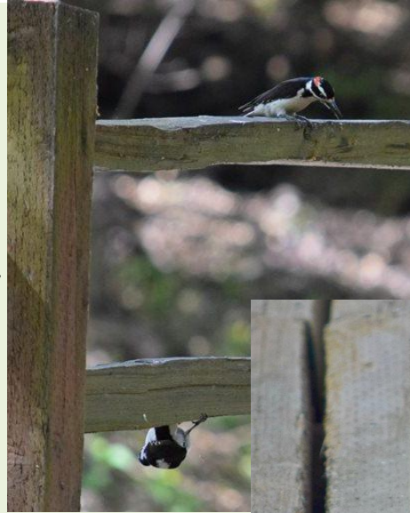
A pair of Hairy Woodpeckers #48 at Cooley Picnic Area & male Great-tailed Grackle #92 at Shoreline Lake