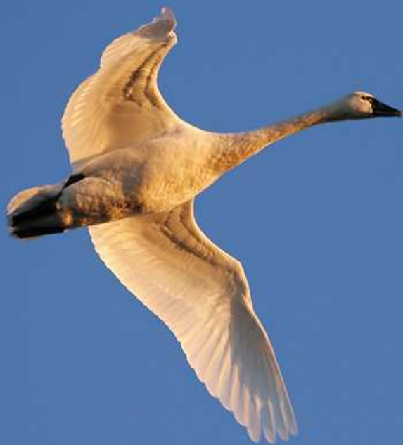
Tundra Swan

Images on page one – Song Sparrow probing items floating on the water's surface. Western Meadowlark foraging and vocalizing. Northern Harrier female eating prey item. Page two – View of the many birds found at the Phil & Marilyn Isenberg Crane Preserve located on Woodbridge Road. Sandhill Cranes flying directly overhead. Mount Diablo Sunset from Staten Island Road with Sandhill Cranes in foreground.